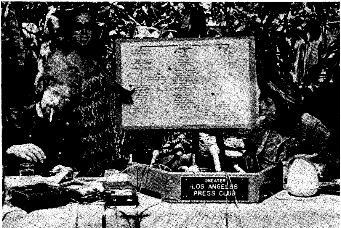
Mae Brussell uses the chart (reproduced elsewhere in this article) to show the chain of command of the conspiracy she is exposing.