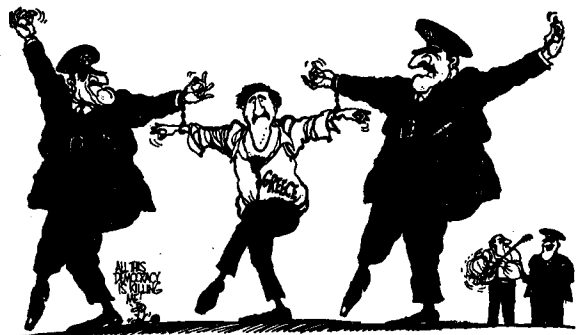
"Smile! You Are Dancing Because You Are Now a Democracy!"

Foreman reacted to his former client's latest assertions by declaring that Ray was "either bluffing or planning to lie" about the conspiracy. "Ray acted alone," Foreman said, "on his bias against black people."