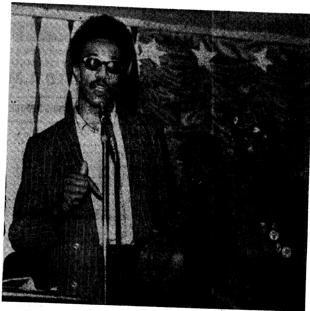
This 1967 picture of Brown was taken at a black power rally in New York.