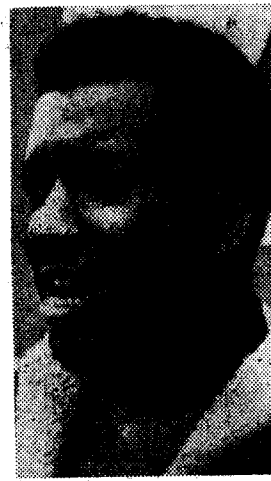
FRED HAMPTON ... slain Panther leader