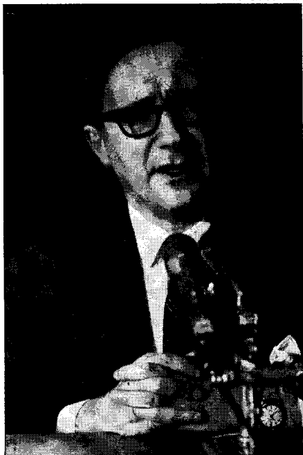
DR. JEAN MAYER Persuasive politicking.

Charming and Caustic. For Mayer (pronounced My-air) it was an important victory. The conference has clearly advised the President that his first obli-