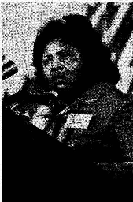
FANNIE LOU HAMER Clarion call.

es and served as an officer for three years (1942-1945), winning 14 decorations. After the war, he returned to the U.S. to become an American citizen and to study physiological chemistry at Yale. In 1950 he became a professor of nutrition and public health at Harvard. Alternately charming and caustic, Mayer has proved his political capabilities in the few months that he has spent in Washington as the President's chief adviser on hunger and in organizing last week's conference. Encouraged by the outcome of the meeting, Mayer said, "It has dramatized hunger and poverty for the press, for the Congress, for the readers of newspapers, for professional people in the health services and social agencies, for the farmers and for industry."