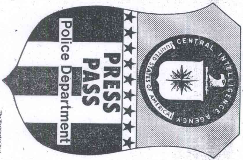
The Washington Post