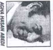
AGHA HASAN ABEDI

■ The Fed is seeking a $200 million fine against BCCI and an order barring BCCI founder Agha Hasan Abedi and other foreign investors from doing banking business in the United States. The Fed said BCCI secretly controlled First American for more than a decade.