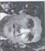
SEN. JOHN F. KERRY

■ Sen. John F. Kerry (D-Mass.) will hold hearings Thursday on the Federal Reserve's regulation of First American, the alleged bribery by BCCI of Peruvian central bankers, and reported links between the Central Intelligence Agency and BCCI.