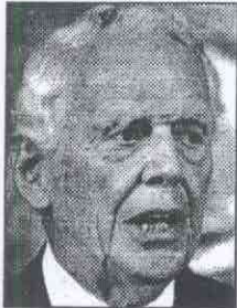
CLARK M. CLIFFORD

Statement by Clark Clifford, April 21, 1981 to the Federal Reserve Board while it considered the acquisition of First American by Middle Eastern investors: