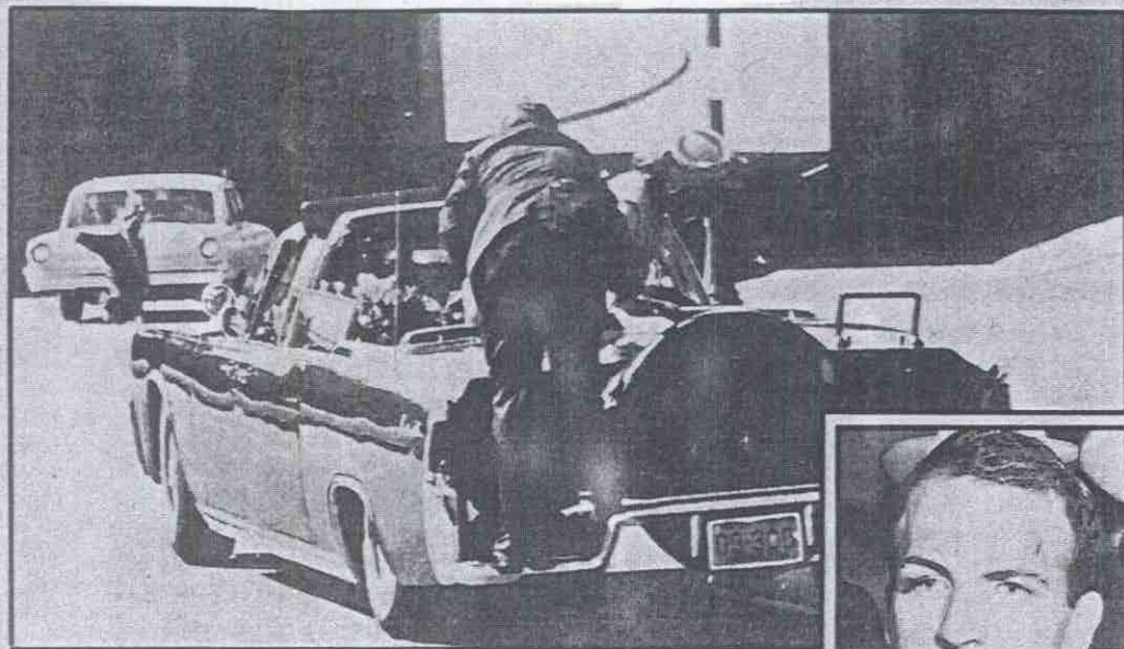
ABOVE: THE ASSASSINATION SCENE of President John F. Kennedy, that no one can forget. RIGHT: Lee Harvey Oswald, the man who killed the president according to all official reports.