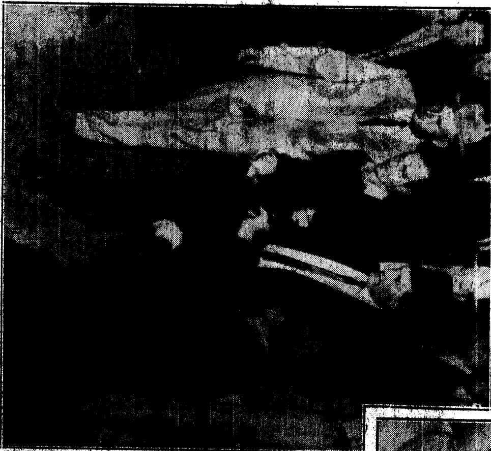
One fringe of plot-removers insists that when Jack Ruby shot Lee Harvey Oswald in basement of Dallas police station, it was to keep him from killing