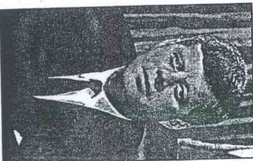
John F. Kennedy

Historians can find only one explanation: the manner of his death. Please see KENNEDY, A10