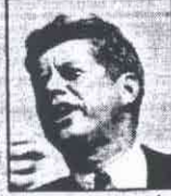
John F. Kennedy

■ Monday — A march that will follow the last four blocks of the JFK motorcade. Marchers are to assemble at the Kennedy Memorial Plaza, at the corner of Market and Commerce streets, at 3 p.m.