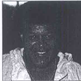
The show stopped: Checker