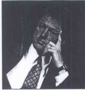
A silence in school: Clinton