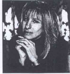
Unhappy memento: Streisand