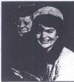
John and Jackie Kennedy

Your older family member's reminiscence: