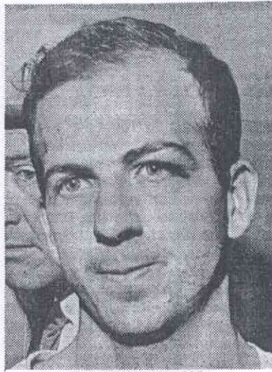
LEE HARVEY OSWALD ... 1953 psychiatric report offers insights