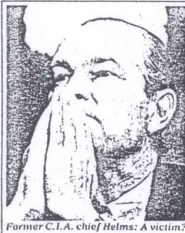
Former C.I.A. chief Helms: A victim?

can people and the Congress have to trust us. You can't legislate morality and integrity. We had a job to do for the United States Government, and we did it. We all faced our moral crises, our personal Gethsemanes, and had to do some jobs by any means possible.