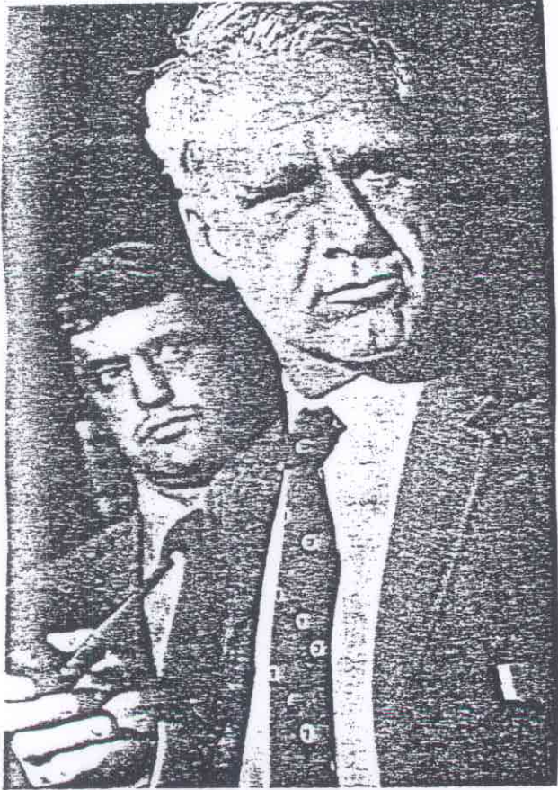
James Schlesinger as C.I.A. head in 1973: A controversial leader.