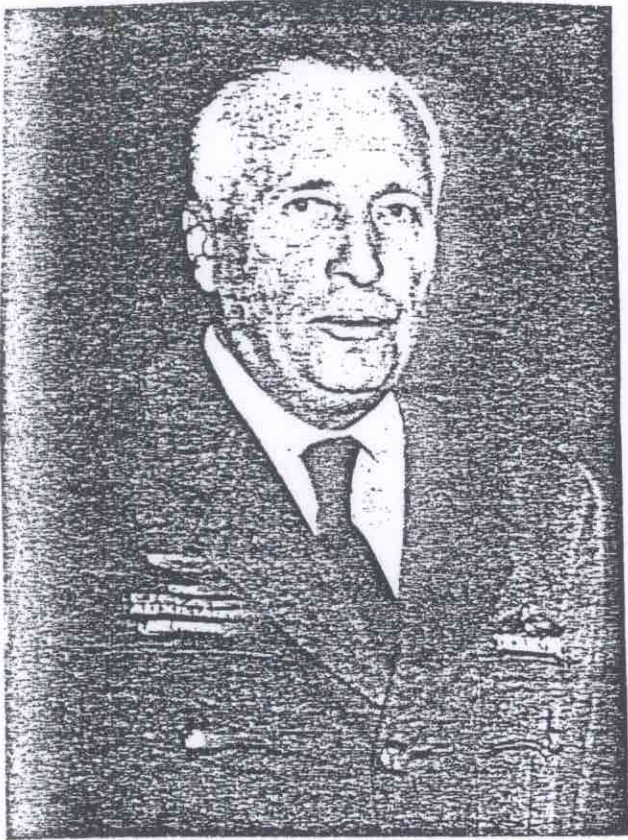
Army (and C.I.A.) officer Cord Meyer: A case of hero worship.

If we went deeper into that question, we might come to understand more. ■