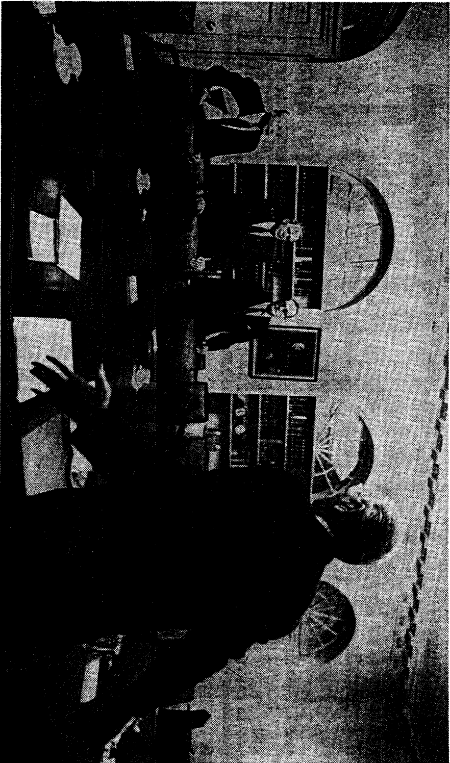
Culmination of the battle: President Johnson's announcement of the bombing halt to Rostow, Clifford and Gen. Wheeler.