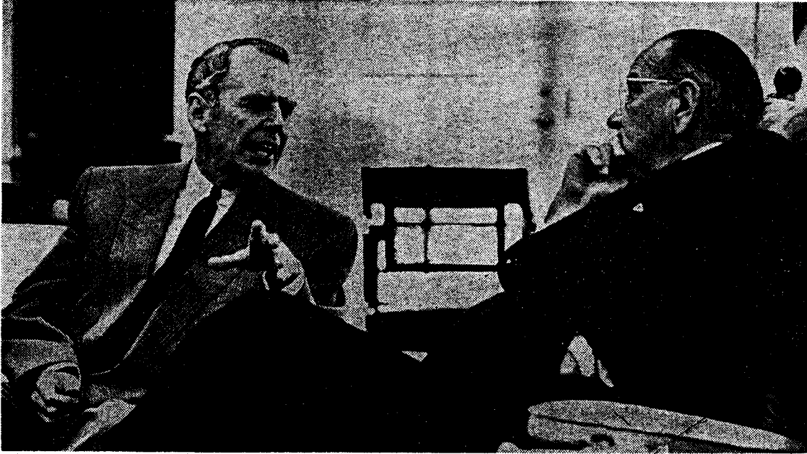
Clifford and Johnson: the battle for the President's mind.

made. Hell, you had a recommendation for 200,000 more men to go in. The basic conclusion was for changing the course of the war. Should there be more troops, and what should be done about the course of the bombing — you got shadings of views on that.”