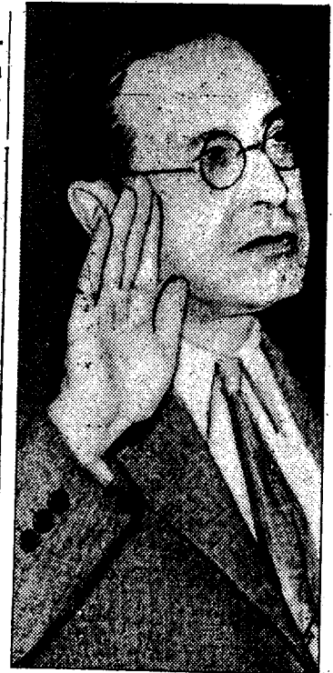
GEORGE S. VIERECK Nazi Propagandist Nabbed By G-Men

In 1926 he described a speech by Hitler as a challenge to peace and not to war and declared there was no reason for the world to get excited because Germany had de-