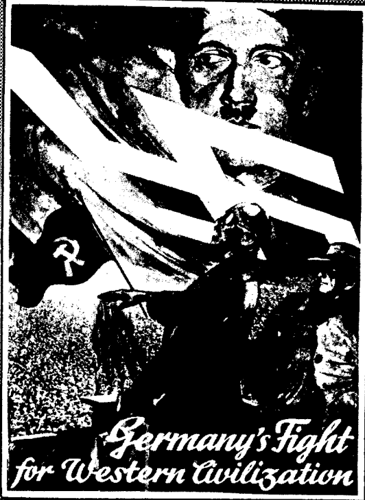
Above and below: Old Nazi propagand material with anti-Communist slant, now taken off the shelves for widest distribution.

Listen to Lindbergh, Wheeler, Norris, Clark, Nye and other America First leaders. Meeting every Thursday at 3142 Wilshire Blvd.