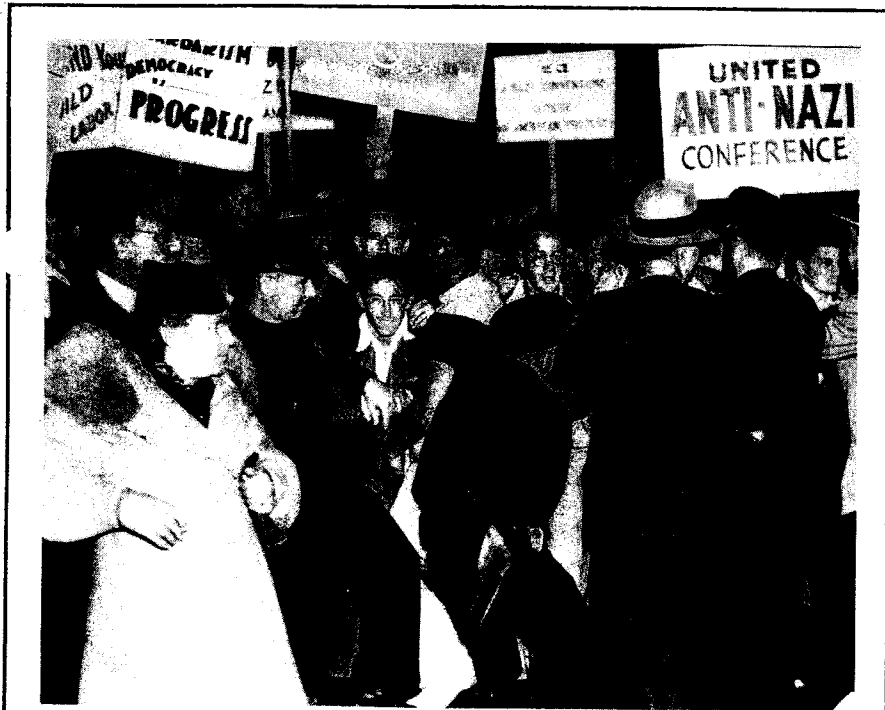
Riot scene in front of Los Angeles German House during convention of Bund's so-called "Anti-Communist Federation of America". Such demonstrations ceased abruptly after Berlin-Moscow Pact was signed. Repetitions are expected now!