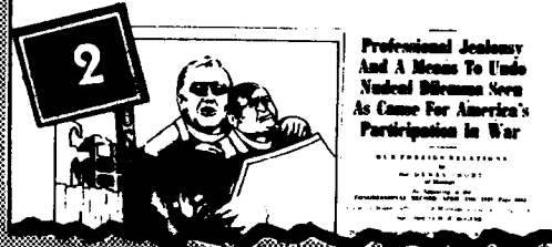
Professional Jealousy And A Mean To Undo National Differences Seen As Cause For America's Participation in War