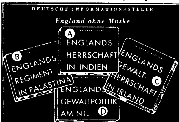
Front covers of new Goebbels publications, "exposing British iniquities". These volumes -- first four of a comprehensive series -- are issued by "Deutsche Informationsstelle" (German Information Office) and entitled, respectively (a) "Englands Herrschaft in Indien" (England's Rule in India); (b) "Englands Regiment in Palastina" (England's Government in Palestine); (c) "Englands Gewaltherrschaft in Irland" (England's Rule by force in Eire); (d) "Englands Gewaltpolitik am Nil" (England's Power Politics on the Nile).

Each one of the Flanders Hall volumes contains a bibliography, giving titles of English books from which material was culled. However, the true source of all this material -- the Deutsche Informationsstelle (German Information Office) -- naturally is kept secret. This organization was exposed in NEWS LETTER of July 17, 1940 (illustration on this page) as an official Nazi propaganda agency which sends large shipments of expensive propaganda booklets into the United States.