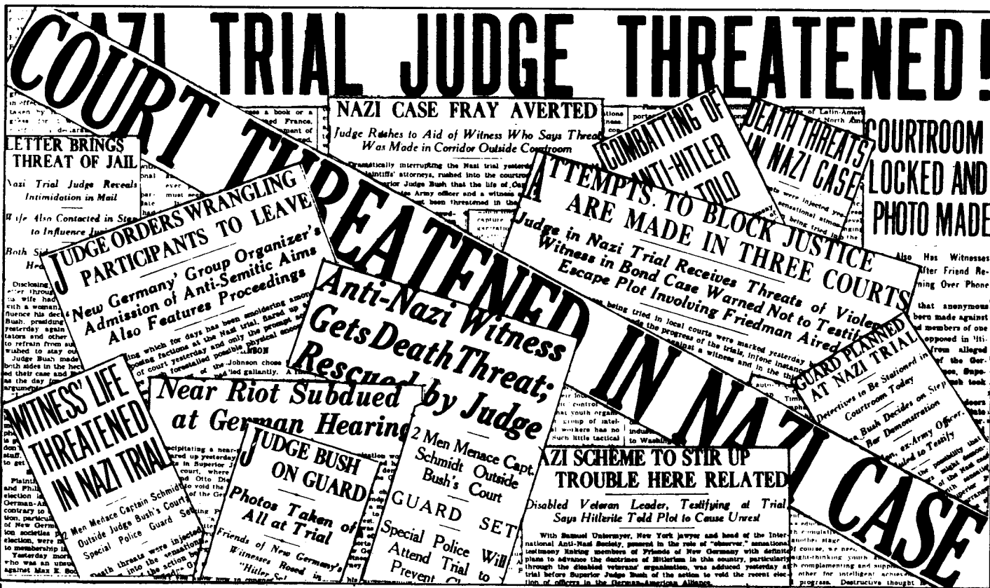
Reproduction from Los Angeles newspapers of January, 1934, showing viciousness with which Nazis fought for control of non-coordinated German-American organizations. Story on page 6.

Although the letter seemed innocuous enough, discerning recipients could easily conclude from the fact that they were thus urged to attend the meeting, that they were expected to vote "right", that is to say, Ja! to anything furthering Hitlerism in the United States. As a precautionary measure, those Sons of Hermann who were sincerely imbued with the spirit of Americanism, were mobilized to present a firm front against Nazi infiltration.