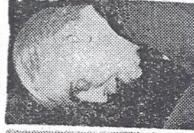
WILLIAM D. PELLEY