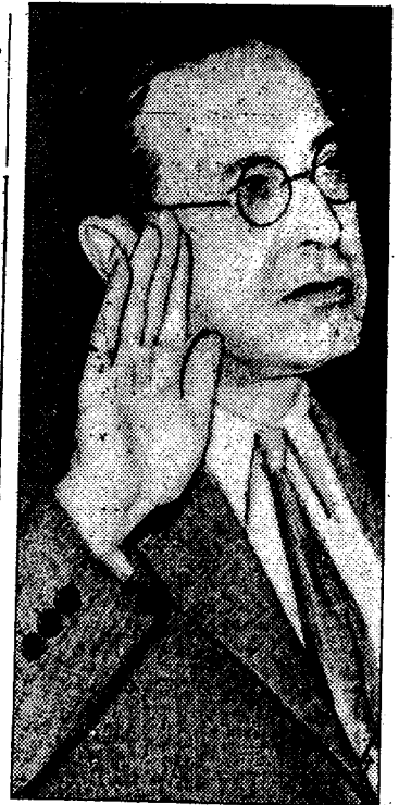
GEORGE S. VIERECK Nazi Propagandist Nabbed By G-Men

In 1926 he described a speech by Hitler as a challenge to peace and not to war and declared there was no reason for the world to get excited because Germany had de-