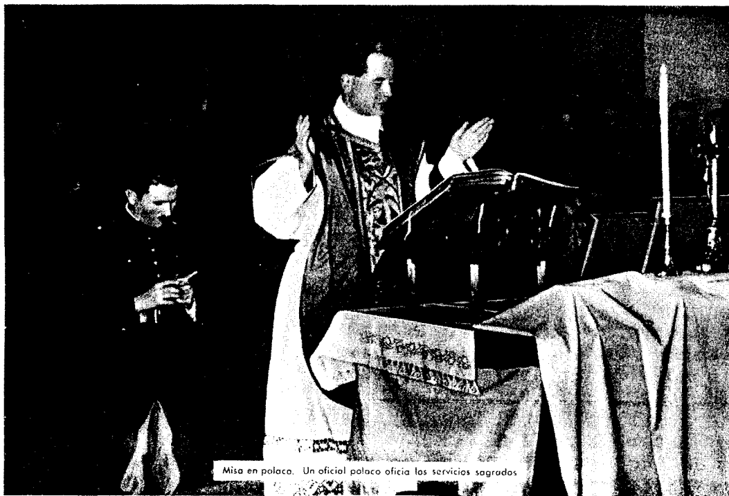
Misa en polaco. Un oficial polaco oficia los servicios sagrados.

The Mexican Ministry of the Interior is now checking up on scores of Nazi and Fascist espionage and propaganda agents. For a long time, such investigation was demanded by patriotic Mexicans, alarmed over the progress of the Nazi and Falange Fifth Column. Matters are rapidly reaching a climax, due to the threatening note delivered to the Mexican Foreign Office by the German Minister, requesting that the government protest to the United States against Wash-ington's blacklist of pro-Axis firms.