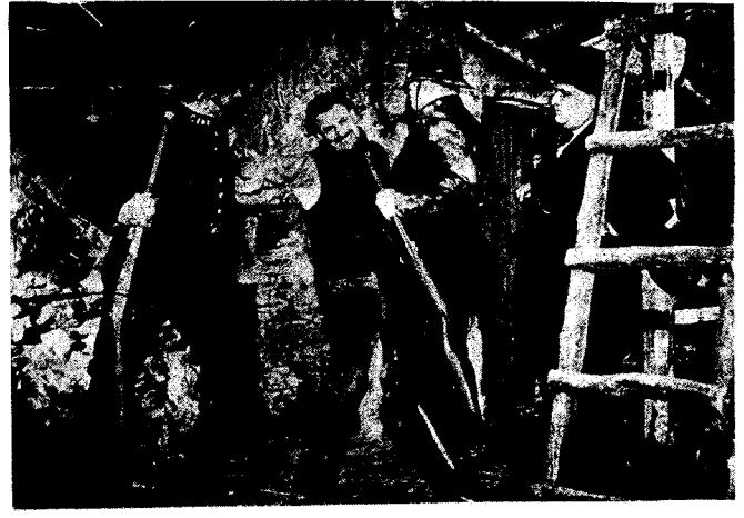
Left: Pickets of German-American Congress for Democracy, parading before 96th Street Theater in New York City, protesting showing of "Sieg im Westen". Right: Still from Motion Picture, "Irish Tragedy", showing Irish peasant being dragged from his home by English bobbies.