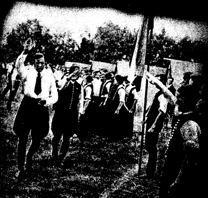
Speakers are greeted in Nazi style