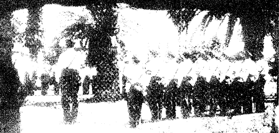
Floral arrangement for Mrs. [Name]