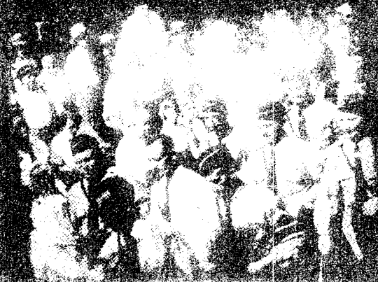
Floral arrangement for Mrs. [Name]