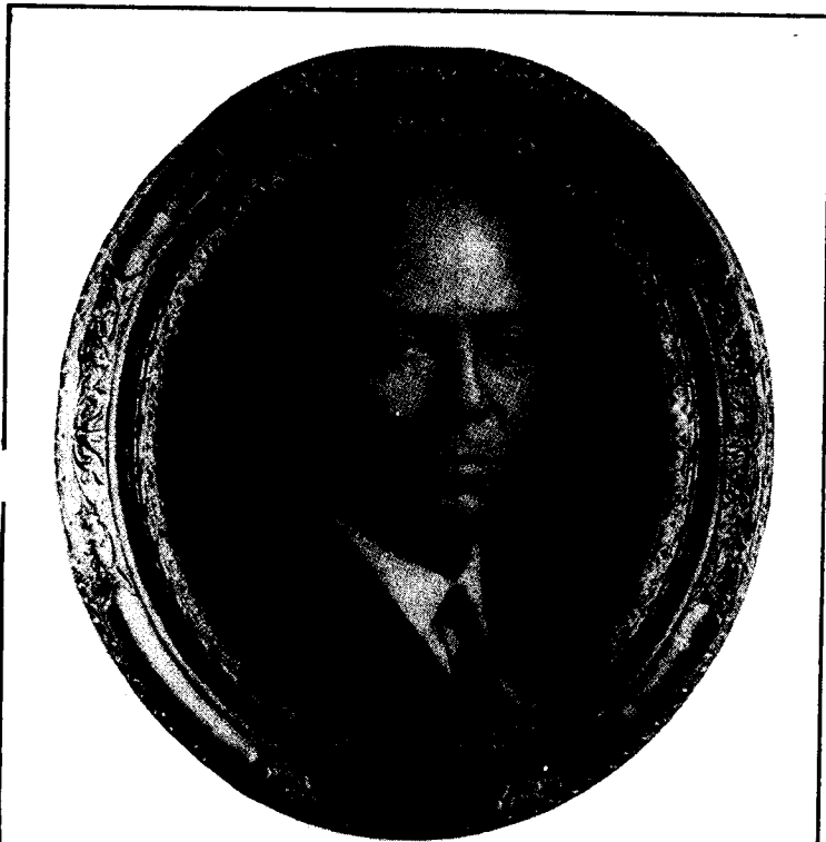
WILLIAM C. BULLITT is the United States Ambassador to France—when his duties there do not interfere with his interests in United States politics.