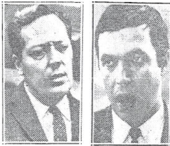
Jim Garrison Prosecutor and chief witness