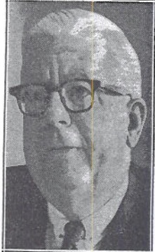
Secretary Fowler Presents tax proposals

Although some leading economic indicators have been slipping, Fowler maintained that the Administration wanted Congress to act now because the very special-