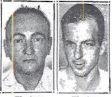
The late David Ferrie The late Lee Oswald Placed at the meeting