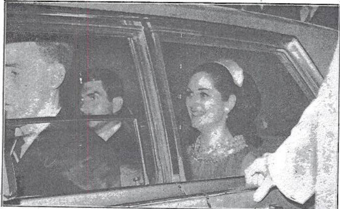
Lynda Bird Johnson and actor George Hamilton sit in limousine in front of the Winter Garden Theatre last night as they left after seeing the hit musical, "Mame." Secret Service men sped them away.