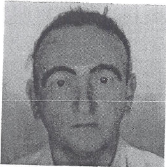
Suspect Ferrie: A suicide?