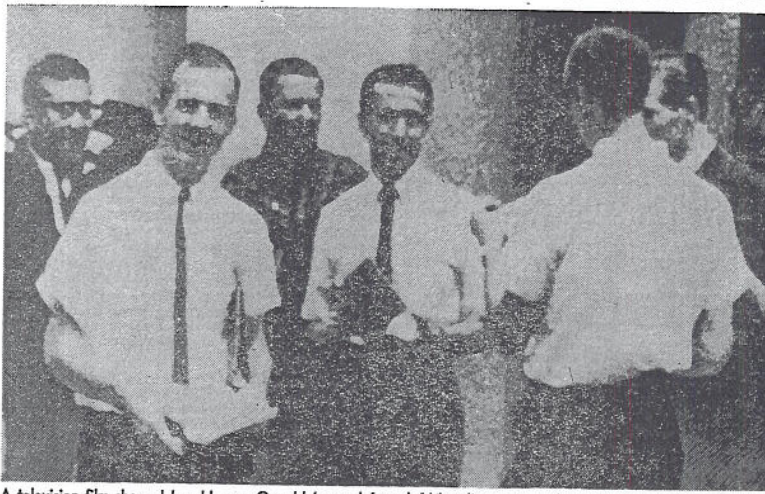
A television film showed Lee Harvey Oswald (second from left) handing out pro-Castro leaflets in New Orleans.