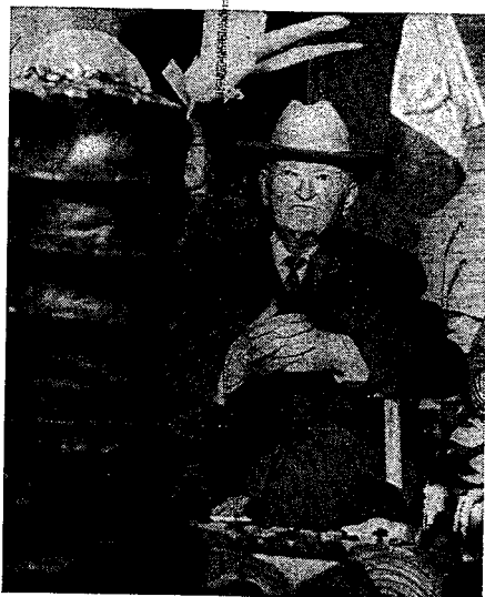
CACTUS JACK Six flags.

It takes a heap o' birthday cake to commemorate a man's 96th birthday. And so when 250 friends of John Nance Garner gathered at his Uvalde, Texas,