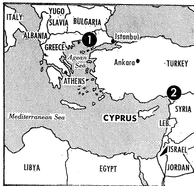
The Washington Post

The crisis has achieved international significance because the governments of both Turkey and Greece have sided with their nationals