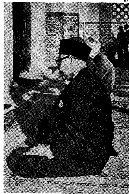
THE TUNKU AT WASHINGTON MOSQUE Wanted, more than sergeants.

Wealthy Chinese, on the other hand, built villas, staffed them with servants and concubines, and took charge of Singapore's economy with little opposition. With an annual per capita income of $450, Singapore today is the wealthiest city in Southeast Asia. But the Malays simply said " Tida apa " ("It doesn't matter"), and rationalized their lowly condition with the help of the Koran, which they interpret as condemning commercial endeavor. As a result, the Malays are largely chauffeurs, street cleaners, firemen and cops,