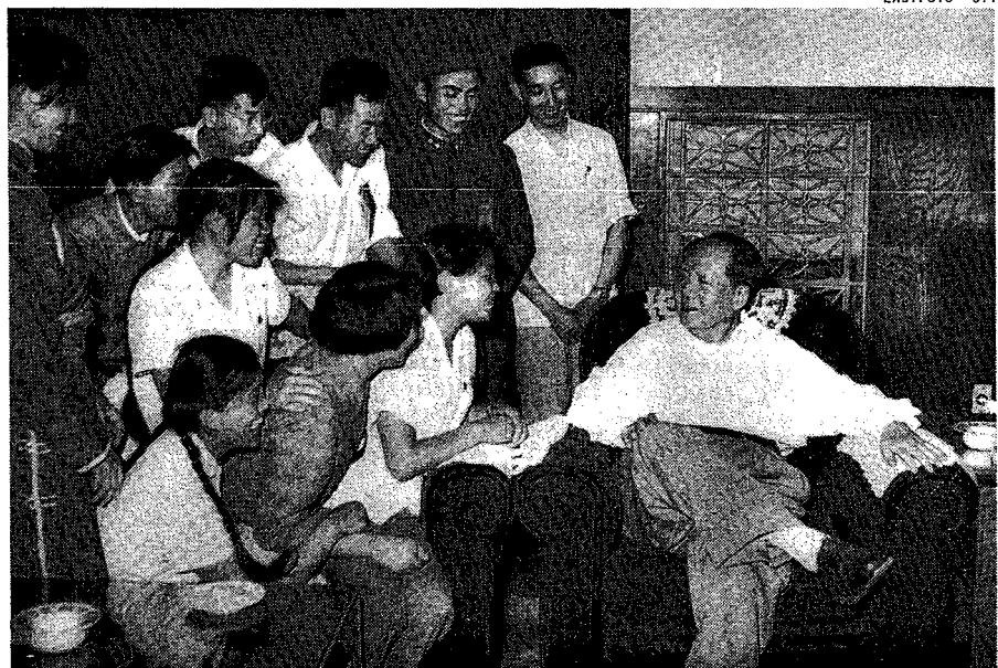
MAO TSE-TUNG RECEIVING STUDENTS Threats of softness in the younger generation.

China’s big city hotels are fair and, for tourists with hard currency, inexpensive (about $6 for a single room with bath). Most of the time the plumbing works, the hot water is hot.