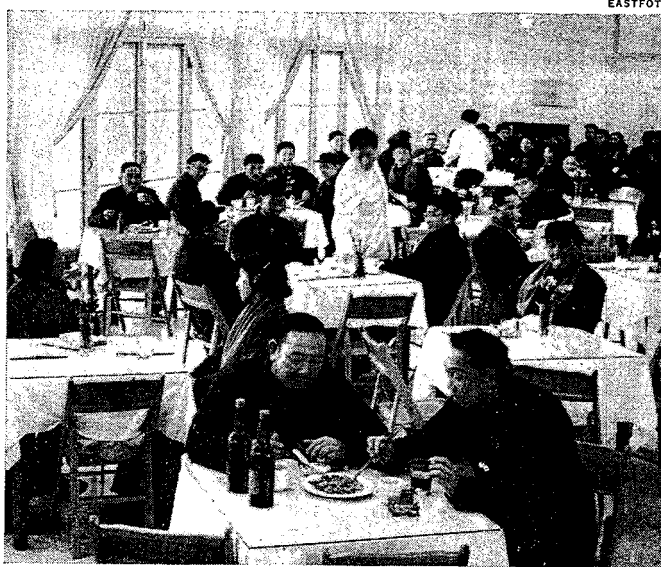
HOTEL DINING ROOM IN SHANGHAI

Pasteurized prostitutes in a vast, songless plain.