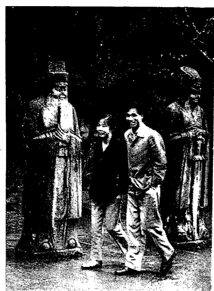
BOY &amp; GIRL IN HANGCHOW*

Pasteurized prostitutes in a vast, songless plain.