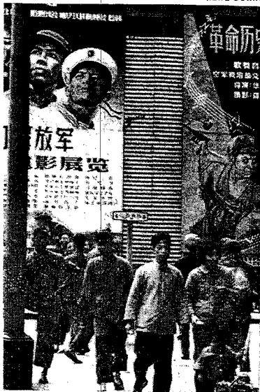
NANKING STREET SCENE