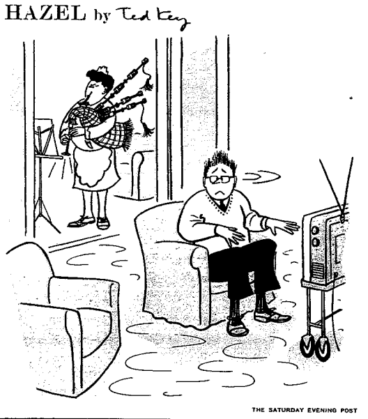
THE SATURDAY EVENING POST

ever else they have done—and they have often behaved with utter ruthlessness—the Communists have at least brought peace and law and order to the countryside and put an end to corruption. Moreover, the peasants' health is better looked after, and their children's education—including, needless to say, ideological education—provided for. Finally, under collectivization, agriculture is now on a more rational and less wasteful basis, with the result that food supplies are increasing. At the same time, food storage and distribution are now better organized, which means that in a bad year there is far less likelihood of famine.