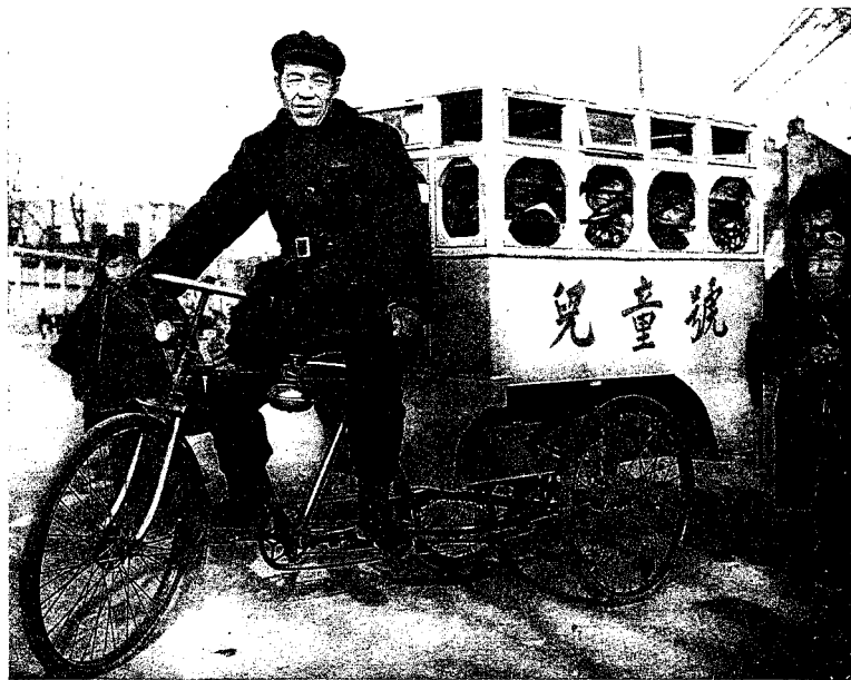
A Peking "school bus" driver halts his pedicab to collect three more passengers on their way to learn about China's destiny.

DESPITE EMBARGOES BY BOTH THE SOVIETS AND THE UNITED STATES, CHINA'S STRENGTH IS GROWING.