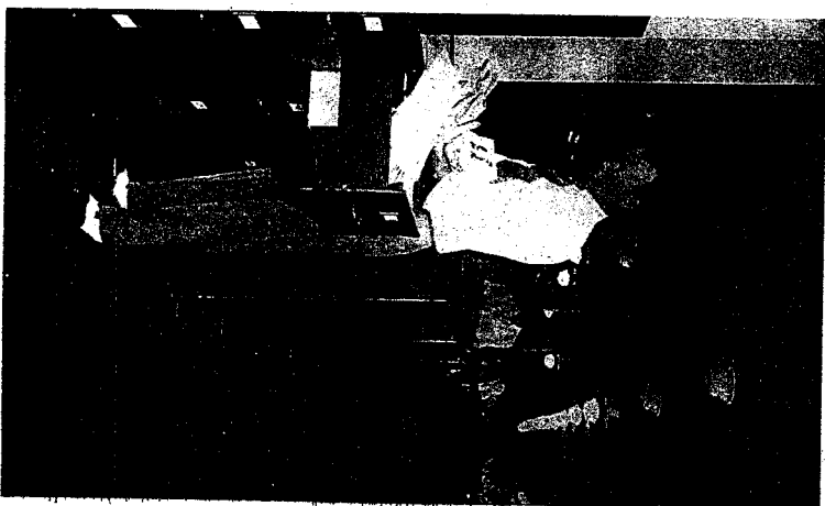
In these vast files are records of millions of public enemies