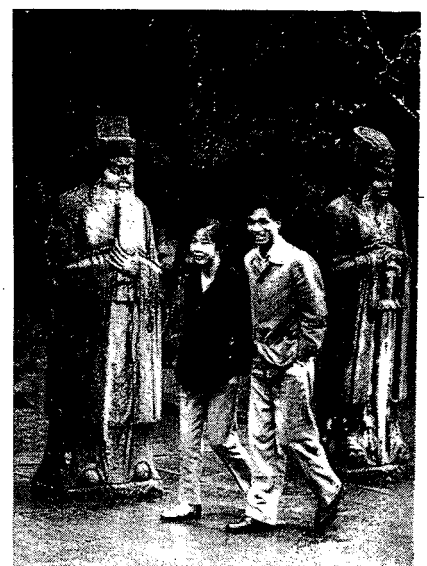
BOY &amp; GIRL IN HANGCHOW*

Pasteurized prostitutes in a vast, songless plain.