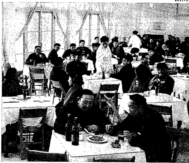
HOTEL DINING ROOM IN SHANGHAI

Pasteurized prostitutes in a vast, songless plain.