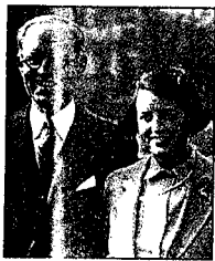
Lee did it.