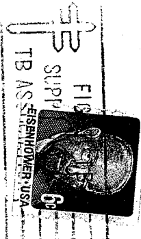
FIG SUPP TB ASS EISENHOWER USA