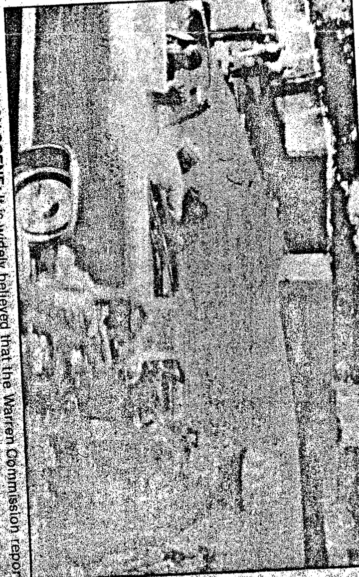
ASSASSINATION SCENE: It is widely believed that the Warren Commission report did not tell the whole story.