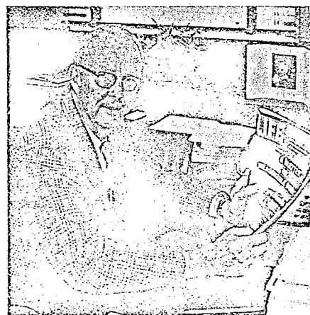
MUCH-THUMBED COPY of "Life" magazine may still hold new clues to the assassination mystery, believes LRL physicist Luis Alvarez (above).

The essence of Alvarez' contribution is the discovery that the Abraham Zapruder motion-picture films of the assassination, printed in Life and in the Warren Report, contain internal clues