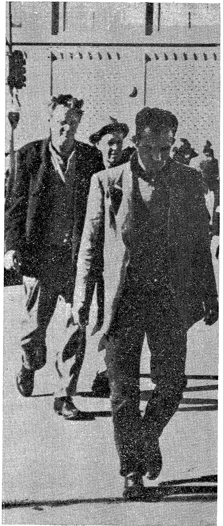
Another view of the two with head of a third man also under arrest.