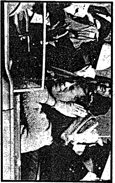
Seconds from death, JFK passes by grassy knoll — and slumps from bullets that sparked a 25-year controversy

A mother of four, and separated from her husband, she jumped at his of-