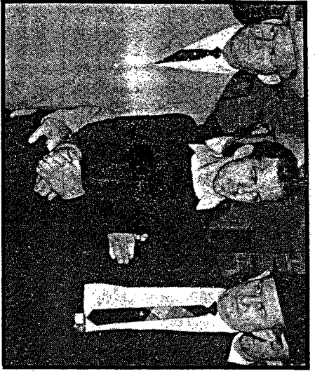
Accused assassin Lee Harvey Oswald (left) broke into a smile when he was being led off to jail because he spotted pal Jack Ruby, ex-flame. Moments later, Ruby snuffed out his life (right)