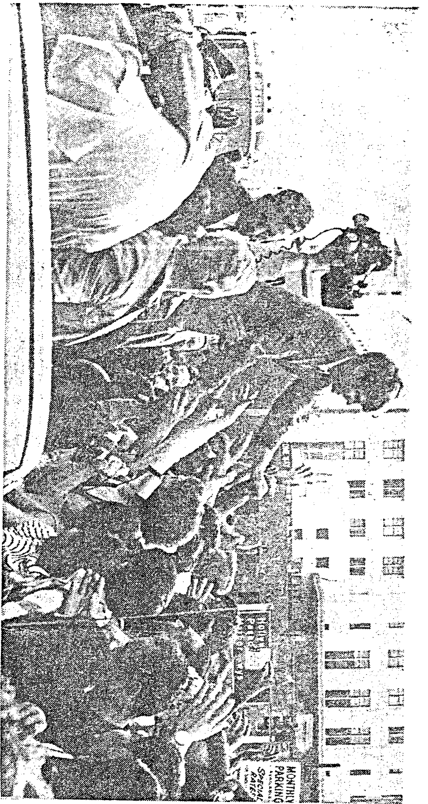
Early June 4, 1968, before his outburst demanding removal of L.A. police protection, Robert Kennedy was already surrounded by turbulent crowds. One policeman's cap can be seen at far left. At various points in the tour that day, RFK's shoes, cufflinks, and even his watch were snatched from his possession.