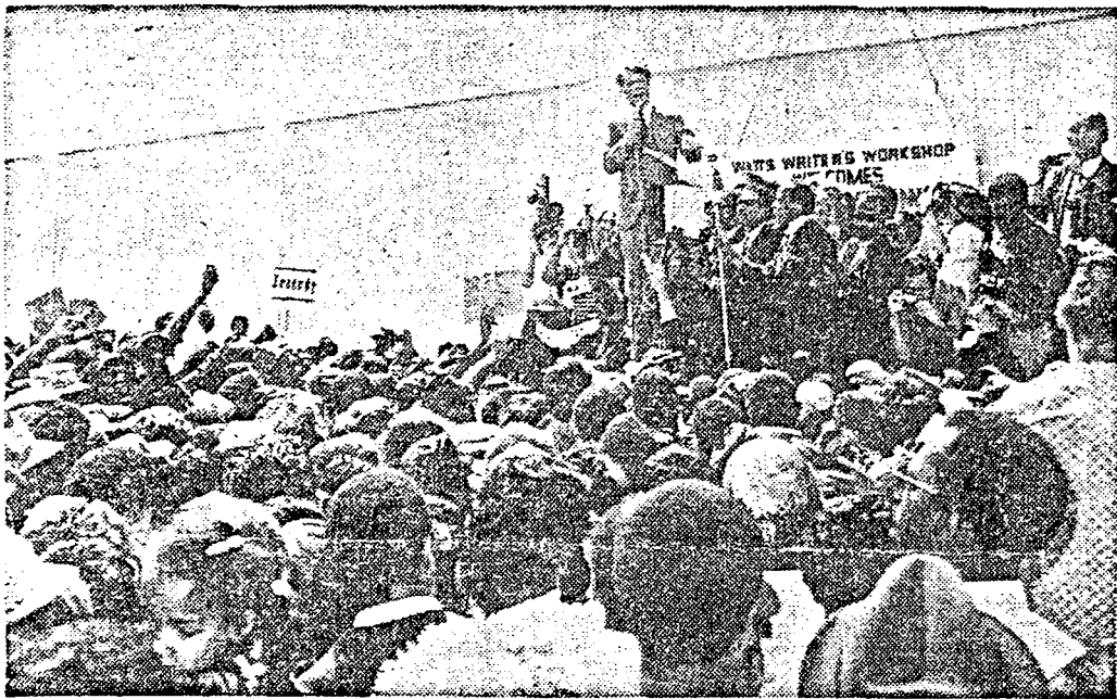
At Watts Writer's Workshop, Kennedy addressed members of the black community. Again, the absence of Los Angeles police is notable.

"Information" disclosure fee LAPD doesn't object to. (note secret service guards.)