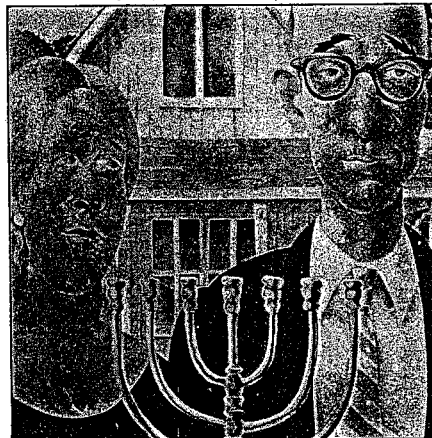
[Page 28] SuperJew