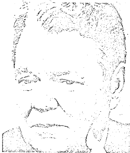
Rep. Harry Boggs of Louisiana disappeared October 1972.