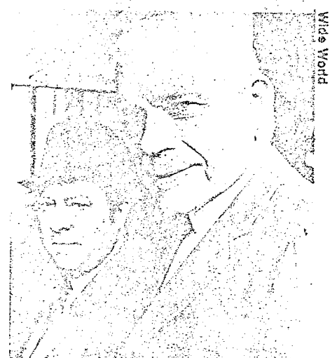
Clay Shaw (right) was accused and later acquitted of murdering JFK.