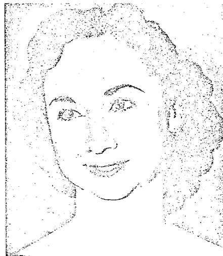
Veteran journalist, Dorothy Kilgallen.