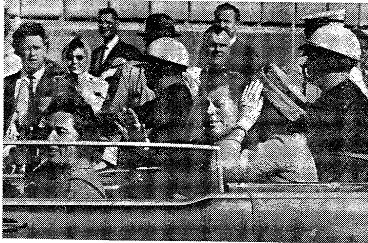
JFK RIDING IN MOTORCADE in Dallas next to wife Jackie and behind Governor and Mrs. John Connally of Texas. Only seconds later, the President was shot.