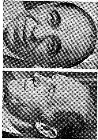
Rep. Henry Gonzalez (left) and Howard Hunt (right). Hunt says he sees a possible pattern in the four shootings.

The resolution would direct the special committee "to conduct a full and complete investigation and study of the circumstances surrounding the death of John F. Kennedy, Robert F. Kennedy and Martin Luther King and the attempted assassination of George