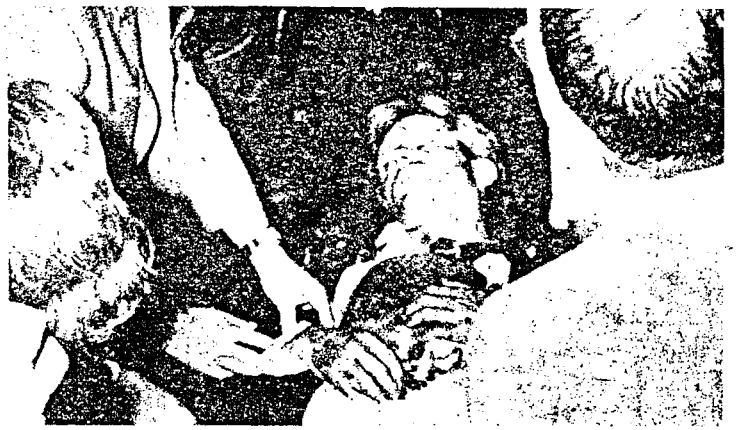
ALIVE, HAPPY , smiling one moment — the next lying dead in a hotel pantry. Mystery still surrounds the murder of RFK. Only one thing is certain: America lost a great man just as it had when his brother was cruelly gunned down.