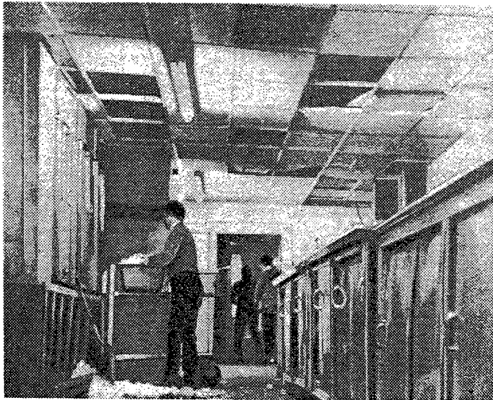
The Ambassador Hotel pantry after police removed the bullet-punctured ceiling panels.